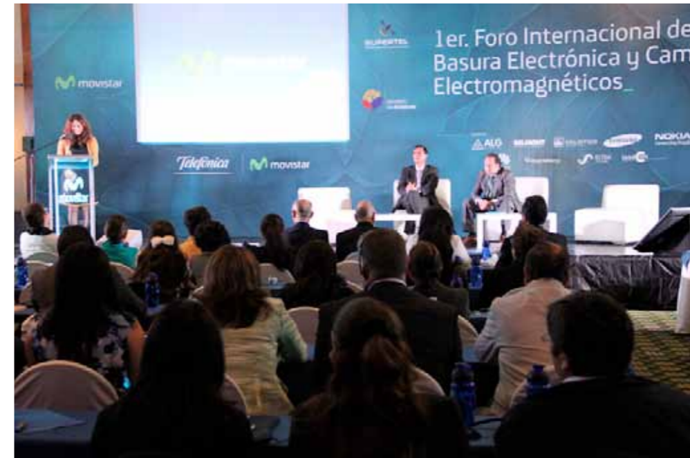
1st International forum on Electronic Waste and Electromagnetic Fields, Quito, 2013.