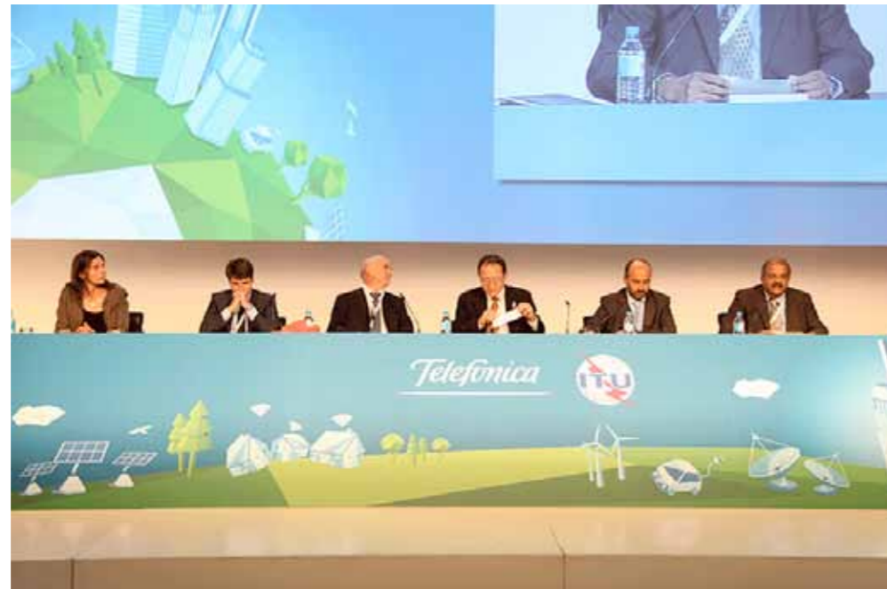
3rd ITU Green Standards Week, Madrid 2013.